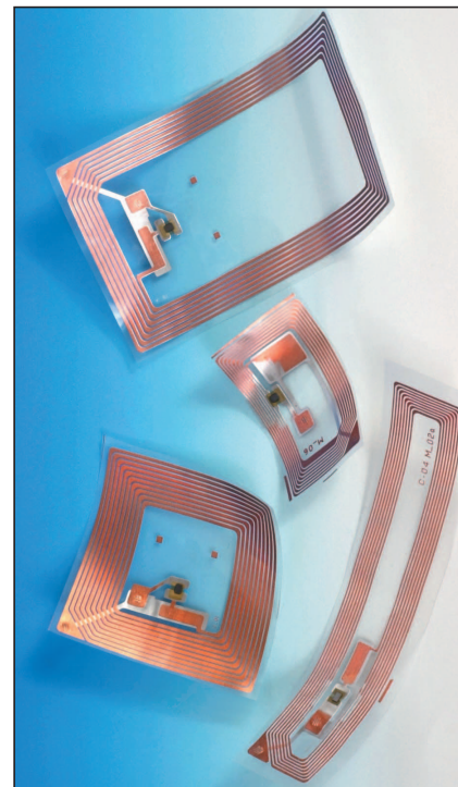
Figure 2. Texas Instruments TagIt passive RFID tags have onboard read/write memories. These tags are delivered in a polymer substrate in reels for easy handling. They are so cheap that they are disposable and truly pervasive.

Chipcon can also equip the CC1010 tag with an 8051 microcontroller to manage 32K nonvolatile flash memory containing programs and data, and 2K of static RAM for scratch purposes.