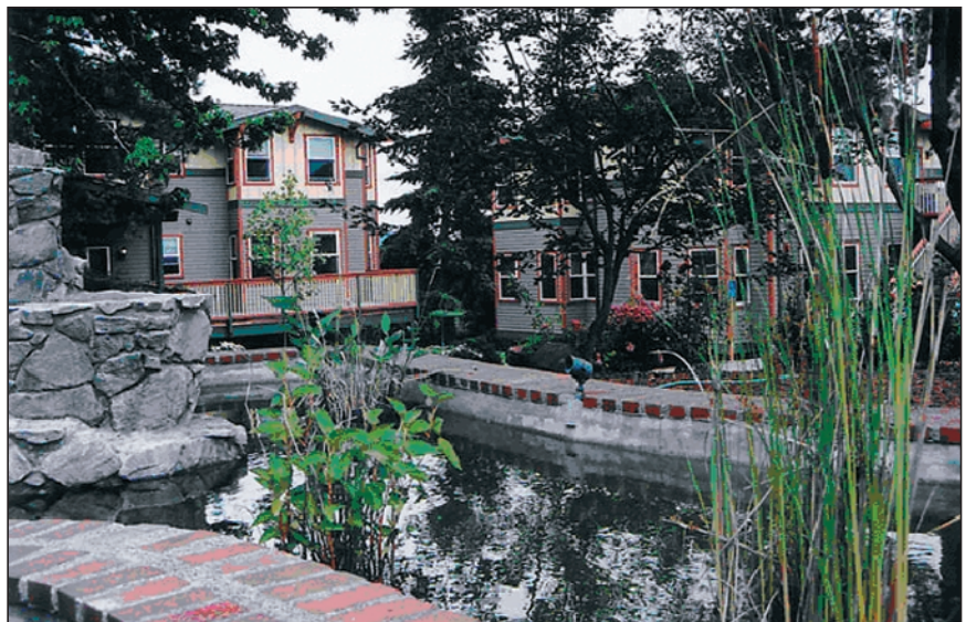
Figure 1. Gardens of the Oatfield residential cluster with pervasive but unobtrusive sensors.

changes, the resident's physician might need to be called. The same databases let the staff clearly communicate with the resident's adult children about changes