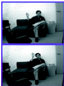
Figure 4: Adjusting a television set by hand signals. To get the attention of the television, the viewer raises his hand, palm toward the camera. When that gesture is detected, the television turns on, and a graphical overlay appears. A yellow hand tracks the position of the viewer's hand, and allows the viewer to use his hand like a mouse, selecting the desired menu item from the graphical interface. Normalized correlation with pre-stored hand templates performs the tracking.

We also made a gesture-based television remote control, again designing the system to make the vision task simple [6]. The only visual task required is the detection and tracking of an open hand, a relatively distinct feature and easy to track. When the television is turned off, a camera scans the room for the appearance of the open hand gesture. When someone makes that gesture, the television set turns on. A hand icon appears in a graphical menu of television controls. The hand on the screen tracks the viewer's hand, allowing the viewer to use his or her hand like a mouse, adjusting the television set controls of the graphical overlay (see Figure 4).