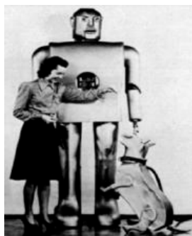
Figure 1: A vision from the past of the future: a natural, gesture-based interface, using camera-based input [4].

Other interfaces attempt to identify the rough 3D pose and motion of a subject. The MIT Media Lab made the ALIVE interactive environment [2] and successors [17], one component of which used vision to estimate body pose and location. This information was combined with artificial agent methods to create a virtual world of synthetic characters that respond to a person's gestures. The Advanced Telecommunication Research Institute (ATR) in Japan has developed a variety of vision mediated graphical systems, including virtual kabuki and the resynthesis of human motions observed from multiple cameras [7, 8]. A system by Sony observed players making different fighting gestures and translated those into a computer game [9]. A collaboration of several research groups allowed the dance of participants to control the motions of virtual puppets [3].